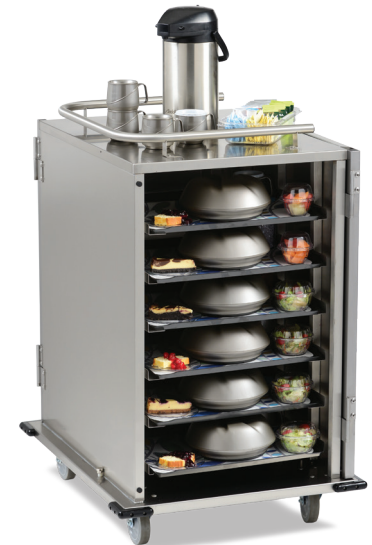
Model SC12S-525DPR with DPR Upgrade Package shown

Visit aladdintemprite.com/patents for patent information.